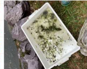
RS's Friday Flyer: Aidan (Maple)