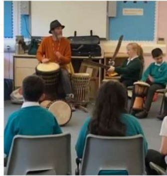
4H's Friday Flyer: