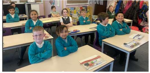
2T or Victorian children?