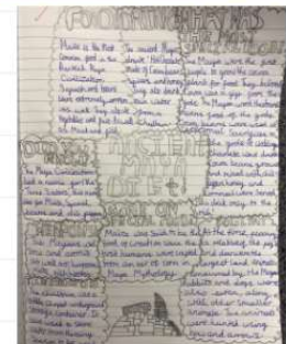
6P's Friday Flyer: Reem (Oak)